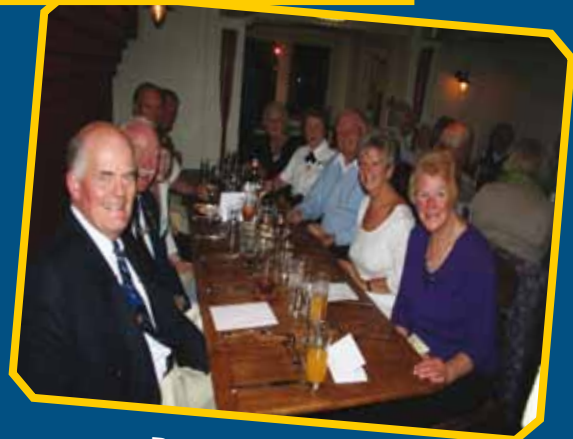
Braods Fleet tuck in