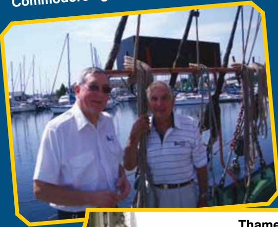
Commodores get together in Suffolk