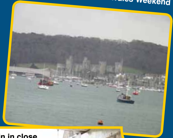
Thames fleet lockin in close